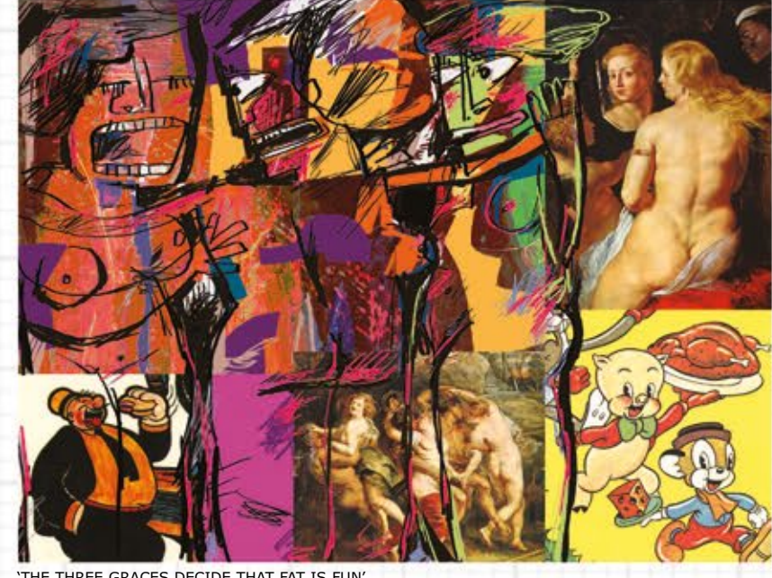
'THE THREE GRACES DECIDE THAT FAT IS FUN' Hexachrome print with silk screen Limited edition of 30 60x80cms